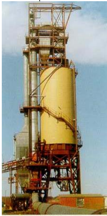
TV Dryer for nickel sulphide

Safety equipment is included with all directly heated dryers to protect against fuel/air explosion and where flammable materials are being handled that might give rise to a dust explosion. Common earth bonding is used for all metal items to prevent static build up.