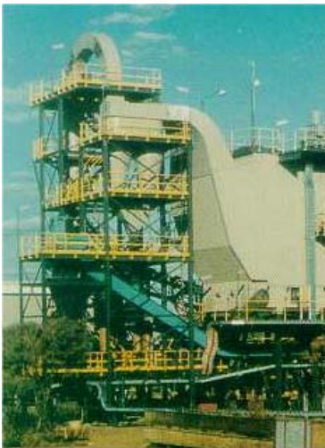
TV Dryer for mineral concentrates

The Thermo-Venturi Dryer operates by passing heated air upwards through a vertical column at a velocity such that the wet material, when introduced by a suitable feeder, is simultaneously dispersed, pneumatically conveyed and dried. The exhaust air from the drying column is passed to a suitable product collection system designed to meet appropriate emission standards.