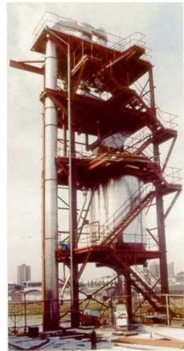
TV Cooler for glucose

In most TV drying systems, hot air is provided using oil or gas as the heat source. These heaters are supplied to comply with appropriate safety standards.