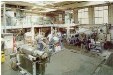
General View of Test Centre