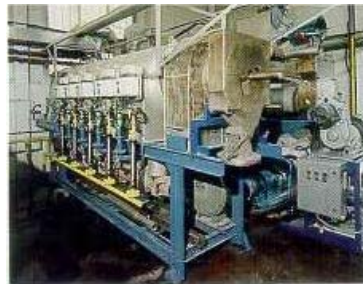
Indirectly Heated Rotary Dryer