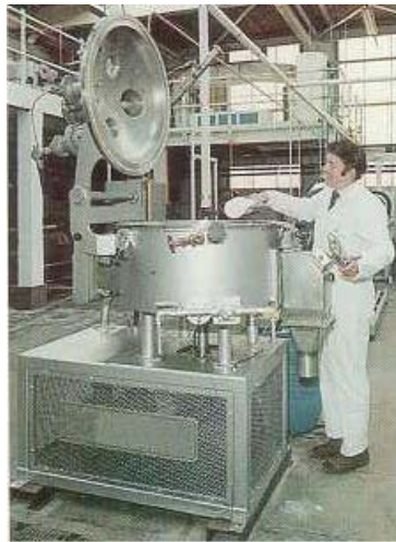
Vacuum Pan Dryer

An ongoing programme is in place investigating new drying processes and improvements to our existing range. This ensures that optimum, cost effective solutions are available to meet customers' present and future requirements.